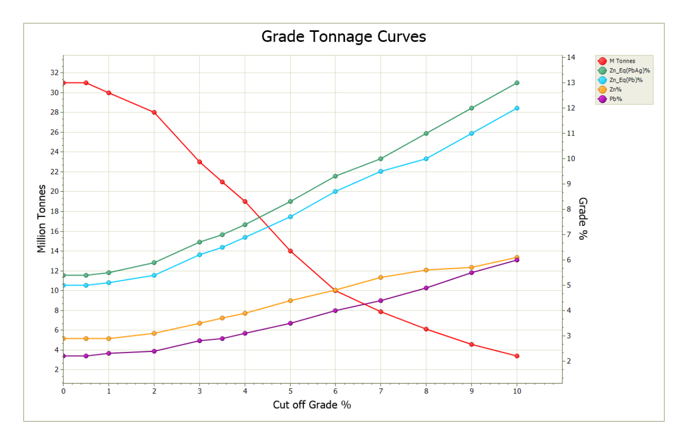
Figure 2: Grade Tonnage Curves, tonnage based on Zn equivalent with Pb and Ag credits