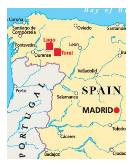
On 17 February 2016, the Company issued 4,515,041 fully paid ordinary shares at GBP0.00144 per share as part of the consideration payable for the grant of the option to acquire the above exploration assets in Spain resulting in 623,302,394 ordinary shares being issued.

The Company believes that the prevailing market prices for lead and zinc will strengthen further, underpinned by an anticipated fall in market supply. Accordingly, it believes that the more advanced Toral Project, in particular, with significant exploration data already available and being located within a politically stable and historic mining region, represents a cost effective opportunity to enter this market sector.