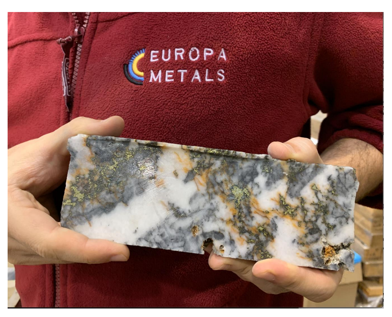
TOD-020 drill core with highly visible chalcopyrite copper sulphide mineralisation

*Zn Eq (Pb, Ag)% is the calculated Zn equivalent incorporating silver credits as well as lead; (Zn Eq (PbAg)% = Zn + Pb*0.96 + Ag*0.022). Zn equivalent calculations were based on 3-year trailing average price statistics obtained from the London Metal Exchange and London Bullion Market Association giving an average Zn price of US$2,500/t, Pb price of US$2,100/t and Ag price of US$17/oz.